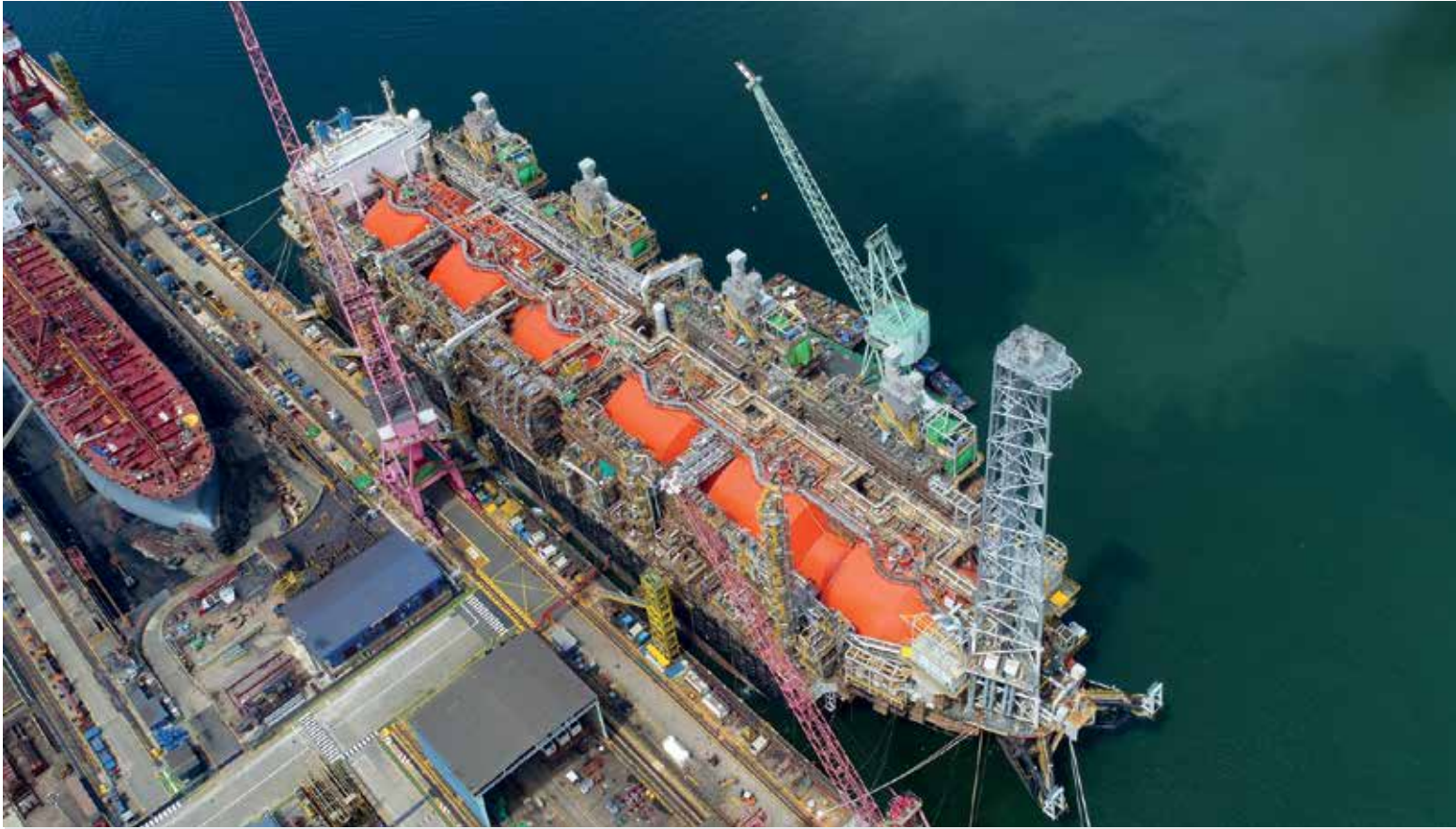
Keppel Shipyard will soon deliver the world's first converted Floating Liquefaction Vessel, Hilli Episeyo (pictured), to Golar LNG