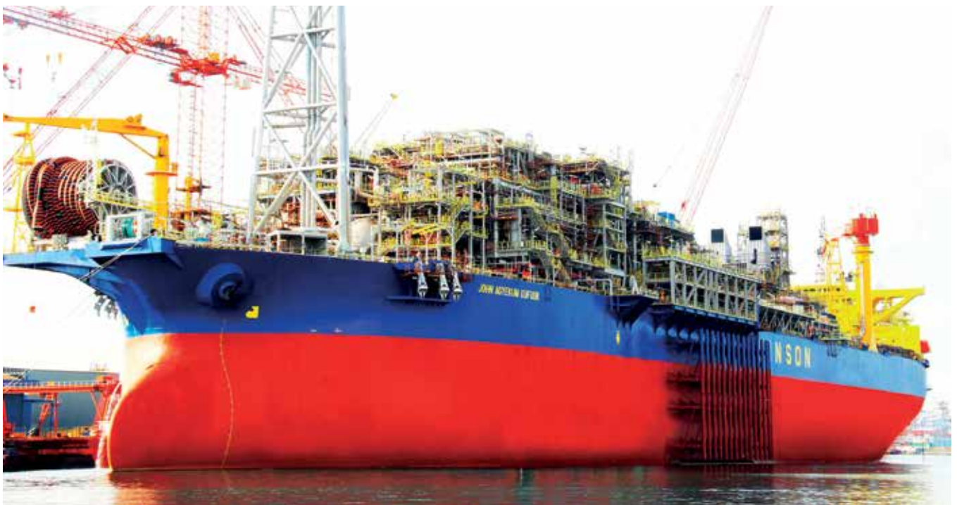
Keppel O&M delivered three major projects in 1H 2017, including FPSO John Agyekum Kufuor (pictured)