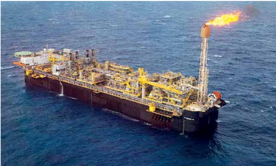
FPSO P-66 achieved first oil on 17 May 2017 in the Lula Sul field, Santos Basin, Brazil

Capable of drilling at water depths of up to 3,600 feet, the deepwater semi will be deployed to support the Indian Oil and Natural Gas Corporation.