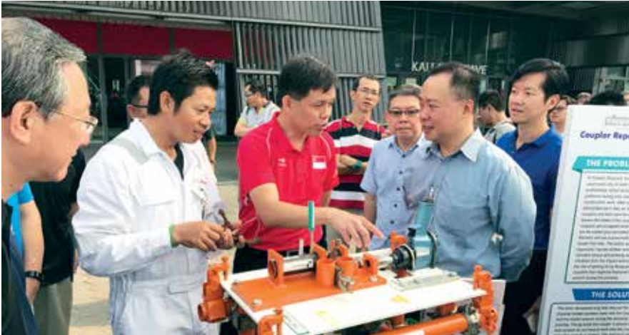
The launch of the National WSH Campaign 2017 was graced by Mr Chan Chun Sing (centre in red), Minister in Prime Minister's Office and Secretary General, NTUC, and attended by management from Keppel O&M

As part of ongoing efforts in safety excellence, Keppel Offshore & Marine (Keppel O&M) participated in the 2017 National Workplace Safety and Health (WSH) Campaign launched on 22 April 2017 and showcased projects such as the