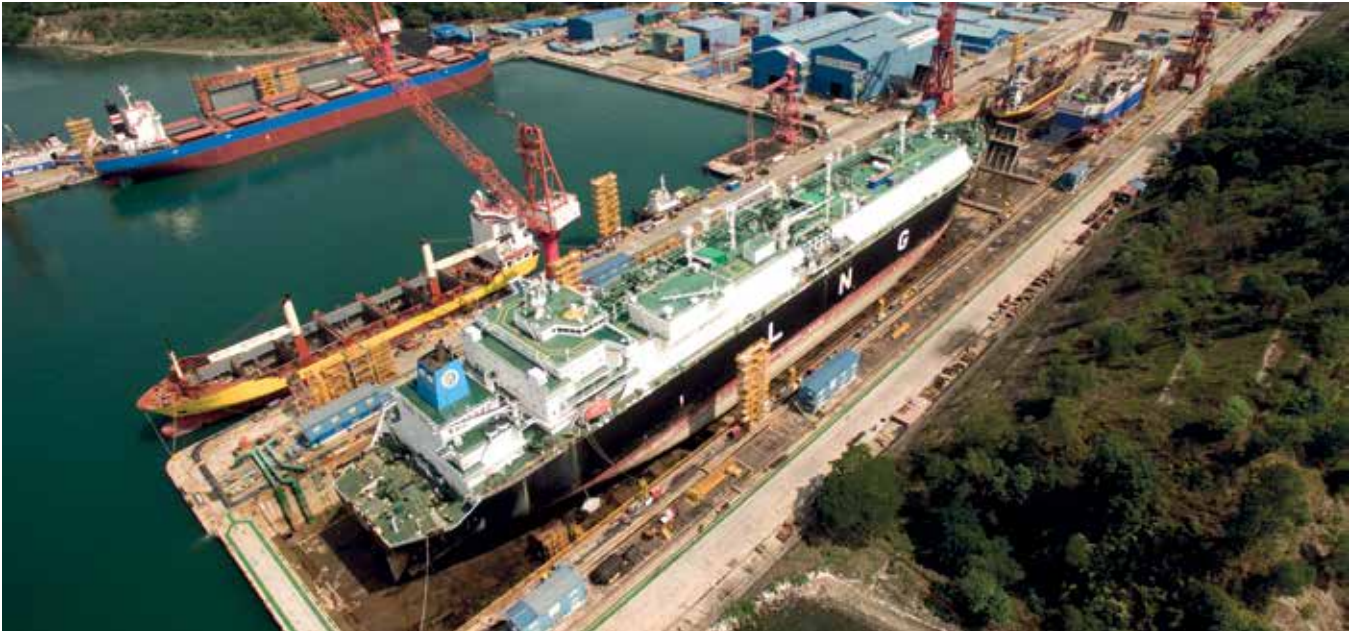
LNGC OB River at Keppel Subic Shipyard's drydock, the first of its kind to undergo repairs at a yard in the Philippines

Keppel Subic Shipyard expands expertise in LNGC repair market.