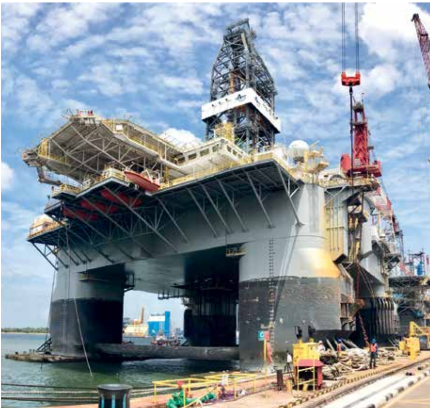
Upon re-delivery, Atwood Condor (pictured) will be deployed to the Greater Enfield Project located in Western Australia

On 17 October 2016, Atwood Oceanic's jackup rig, Atwood Orca, arrived in Keppel Shipyard for repair and refurbishments works. Leveraging the complementary strengths within its network of yards, Keppel Shipyard worked closely with Keppel FELS to ensure that the rig was re-delivered on time and with zero incidents on 20 April 2017.