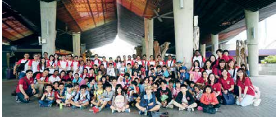
After a successful event at Gardens by the Bay, Keppel FELS hopes to continue the ongoing collaboration with MCYC Community Services Society