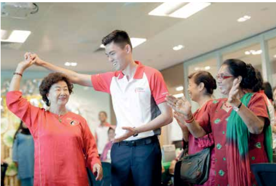
A volunteer from Keppel FELS accompanying contestants of the Best Dressed competition as they walked down the runway

The happy occasion wrapped up with a Best Dressed competition. Spirits were high as the audience cheered on the sporting contestants who gamely showed off their colourful ethnic costumes as they walked down the runway.