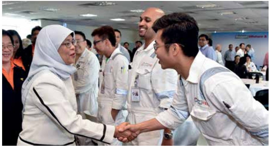
Madam Halimah (left in white), then-Speaker of Parliament, interacted with Keppel O&M employees to find out more about their well-being

Offshore and Marine Engineering. I feel assured that the union and management are working together to navigate these challenging times, and remain hopeful that together, team Keppel will emerge stronger."