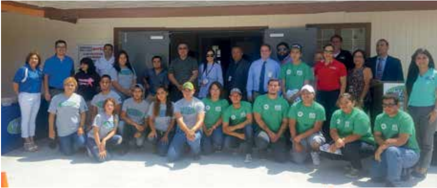
The opening of the Keppel AmFELS construction workshop provides opportunities for young adults to be trained in construction