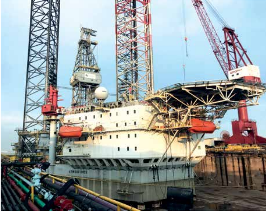
Keppel FELS and Keppel Shipyard worked closely together to ensure that Atwood Oceanic's jackup rig, Atwood Orca (pictured), was re-delivered on time and with zero incidents

Displaying its trademark strong project execution and efficient operations, Keppel Offshore & Marine's yards continue to deliver projects on time, within budget and safely.