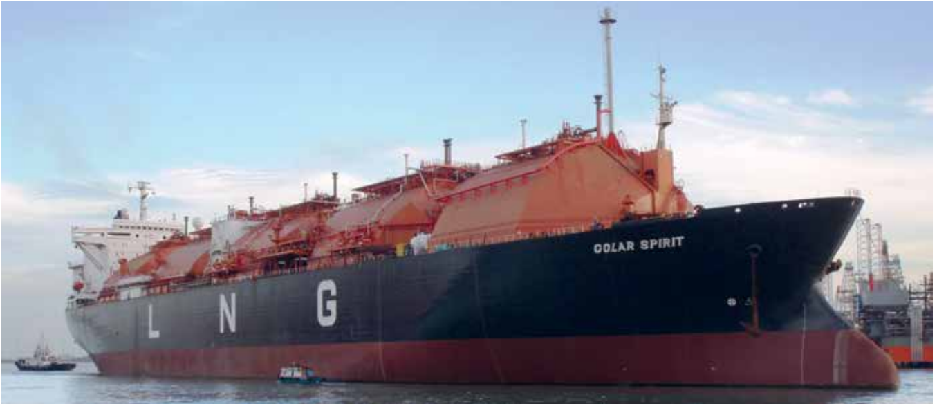
Keppel O&M's strong track record in oil and gas projects include the completion of the world's first Floating Storage and Regasification Unit (FSRU), Golar Spirit (pictured) in 2008 as well as another two FSRUs after that.