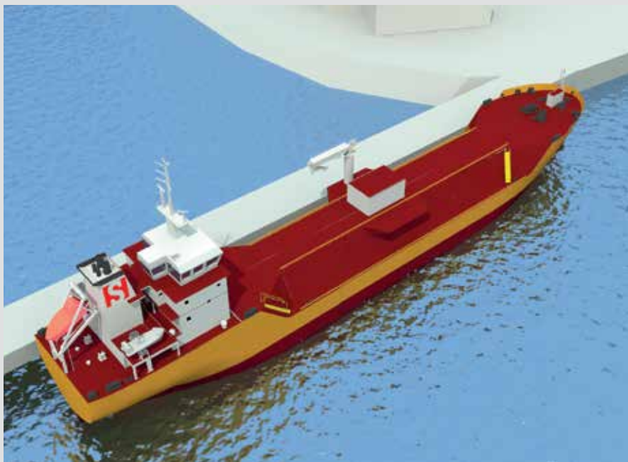
Keppel Singmarine has been selected by long-standing customer Stolt-Nielsen to build their first two small-scale LNG carriers

On 24 May 2017, Keppel Singmarine announced that it had secured a contract to build two Liquefied Natural Gas (LNG) carrier vessels for Stolt-Nielsen Gas, a subsidiary of Stolt-Nielsen Limited.