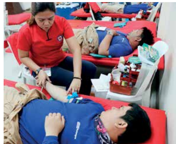
A total of 154 donors participated in the blood donation campaign at Keppel Batangas Shipyard and Keppel Subic Shipyard

The successful blood donation campaign collected different blood types amounting to a total of 69.3 litres from 154 donors from Keppel Volunteers Philippines.