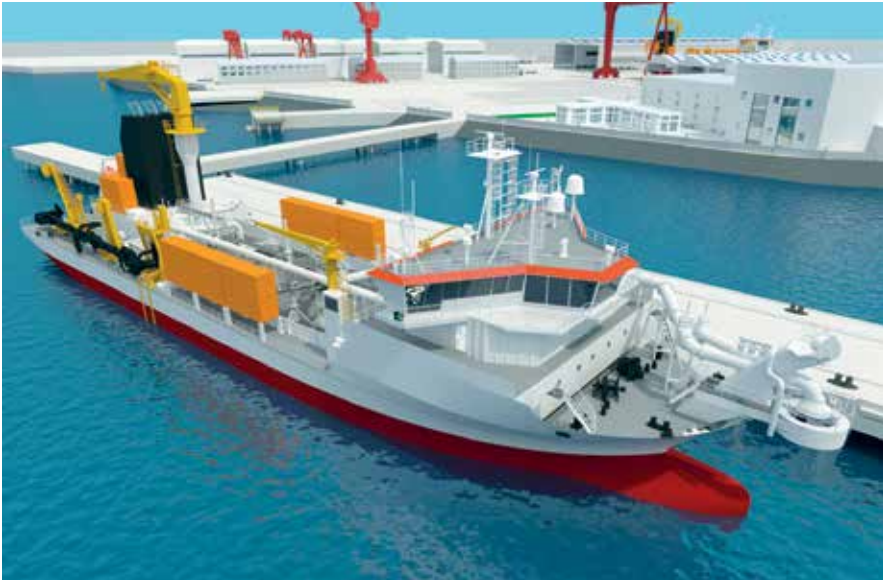
With the new contracts to build two TSHDs secured, Keppel Singmarine is set to deliver a total of up to five dredgers for Jan De Nul Group from 2H 2018 onwards

Keppel Singmarine will be the first shipyard in the world to build an EU Stage V dredger in compliance with stricter international limits on emissions such as the International Maritime Organisation's (IMO) Tier III and European Union (EU) Stage V regulations.