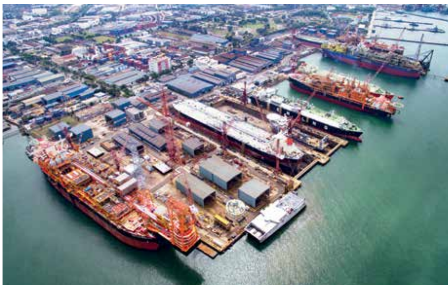
Keppel Shipyard won four contracts for the conversion, repair and modification of vessels