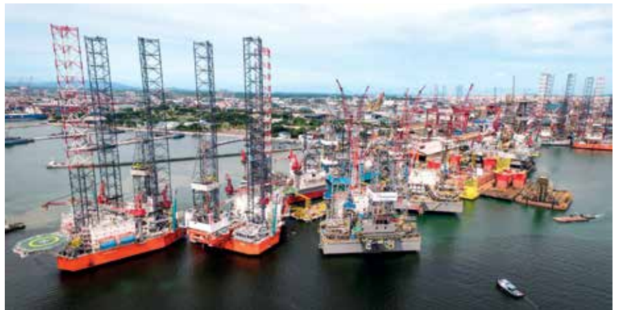
Keppel's deal with Borr Drilling is a testament to the reliability of and strong demand for its KFELS Super B Class rigs, even in challenging market conditions

Based on the finalised agreements, the first three rigs will now be delivered in 1Q 2018, 2Q 2018 and 2Q 2019 respectively, while the remaining two rigs will be