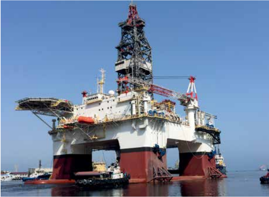
Through its subsidiary, Caspian Shipyard Company, Keppel O&M delivered Heydar Aliyev (pictured), the first modern semisubmersible to be almost completely built in Azerbaijan

improved the Division's cash flow. The first two rigs will now be delivered in 2018 and a third in 2019, while the remaining two will be delivered in 2020.