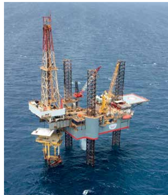
Keppel AmFELS delivered WFD 300 in just two weeks, within budget, ahead of schedule and with a perfect safety record