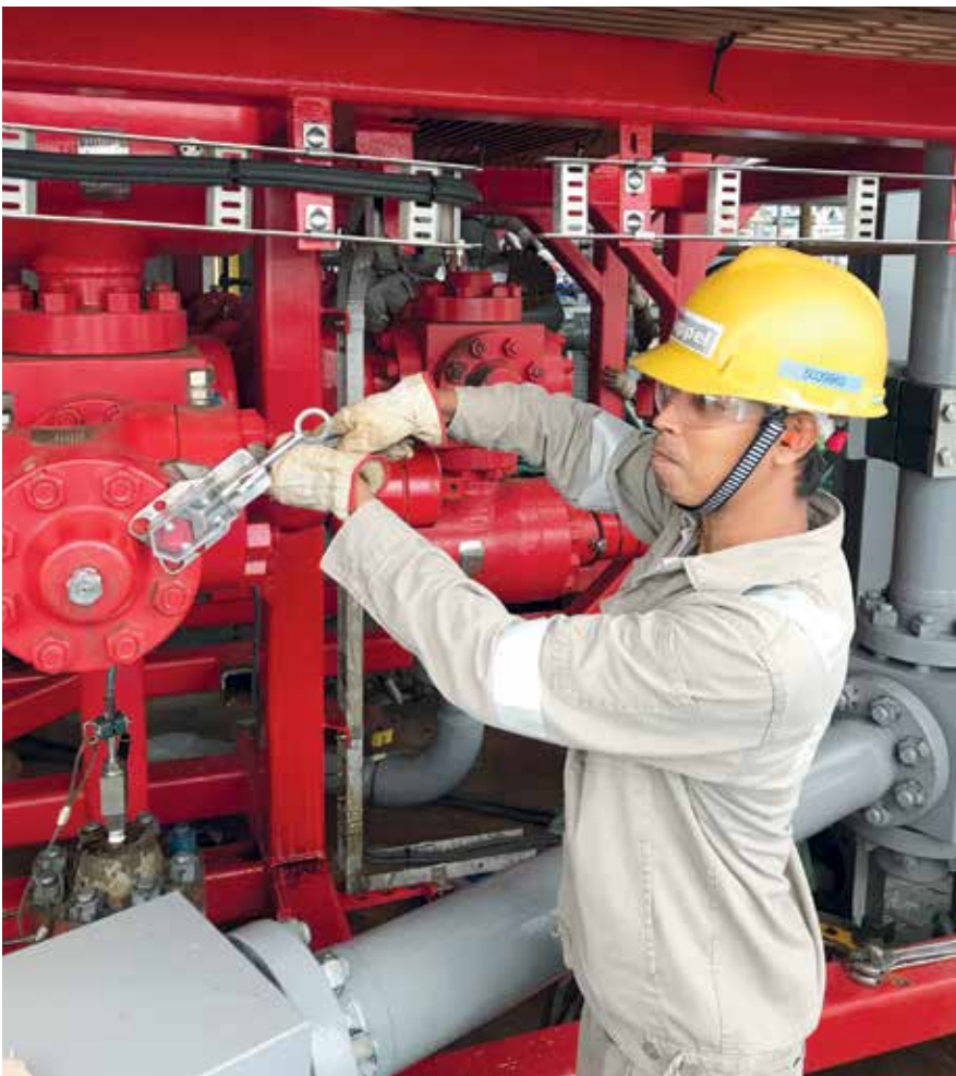
The newly developed tightener, which consists of a spring lock mechanism, reduces the risk of finger injury in constrained spaces especially onboard rigs and vessels

The 'Handy bolt and nut tightener' recently won the Workplace Safety and Health (WSH) 2017 Innovation Award and has been well received by different stakeholders including rig owners, class societies and contractors.