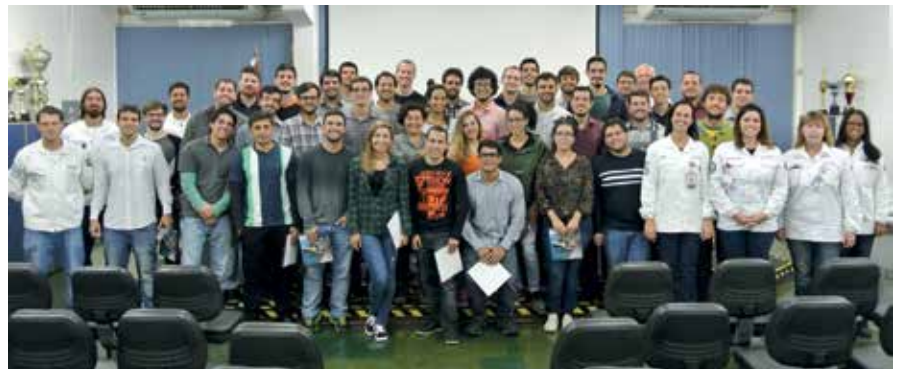
45 students from the Federal University of Rio de Janeiro had the opportunity to learn more about BrasFELS' operations during their yard visit on 13 April 2017

got to see close-up floating production storage and offloading (FPSO) units and drilling rigs.