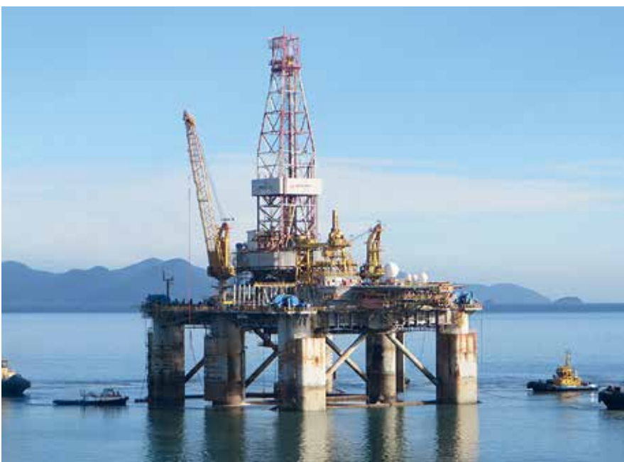
Semisubmersible Olinda Star is the third repair project to be carried out by BrasFELS for Queiroz Galvão