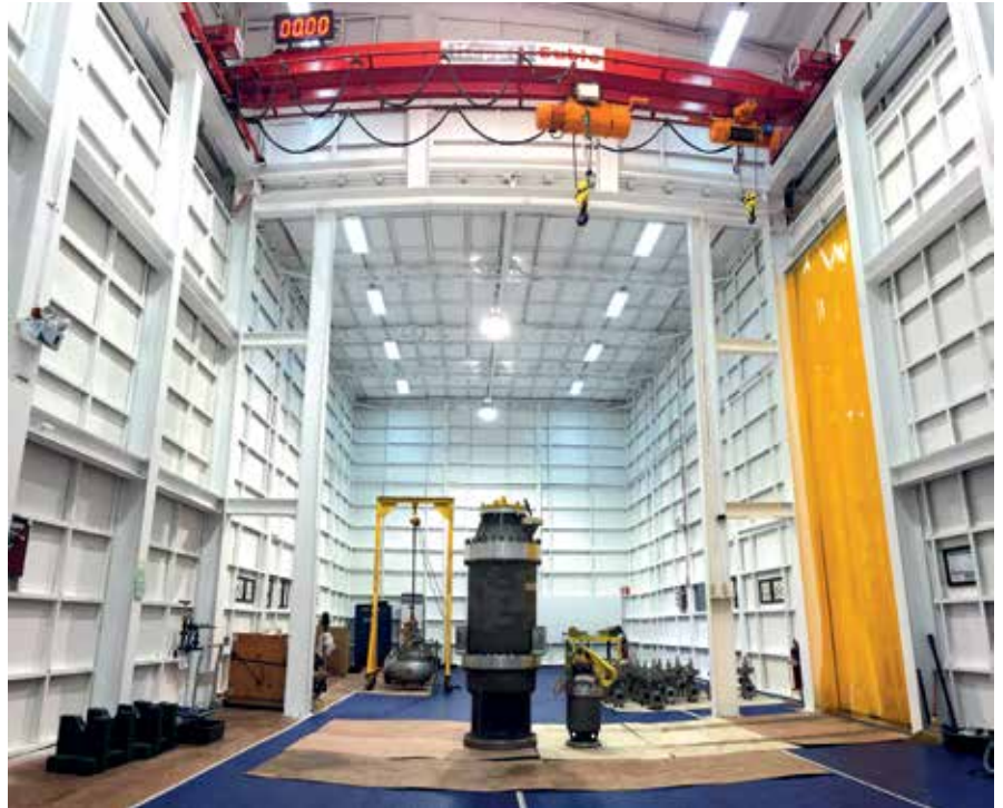
New facilities such as a clean room have been added for the handling of sensitive materials and equipment of LNGCs