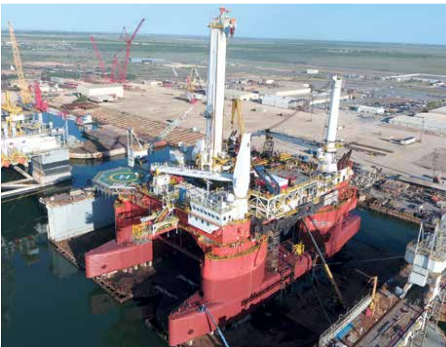
Strong cooperation between Keppel AmFELS and Helix Energy Solutions enabled the successful re-delivery of semisubmersible Q4000

Work on WFD 300 was expediently completed in just two weeks and the rig departed Keppel AmFELS ahead of schedule on 21 May. It was White Fleet Drilling's first rig reactivation and the WFD 300 will be operated by Enterprise Offshore Drilling in the US GOM.