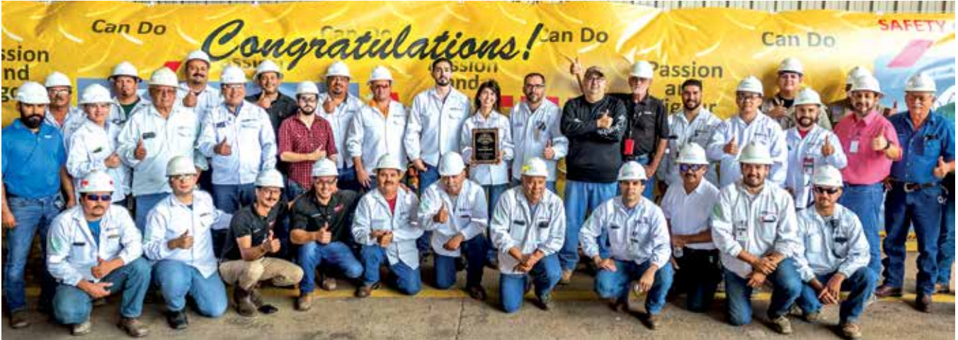
Keppel AmFELS employees were recognised for helping the yard achieve its fourth safety award from the American Equity Underwriters during Employee Appreciation Day on 8 May 2017

For achieving an excellent safety record of zero lost time incident throughout the project, Keppel AmFELS received a safety award cheque of US$10,000 from White Fleet Drilling on 26 June 2017.